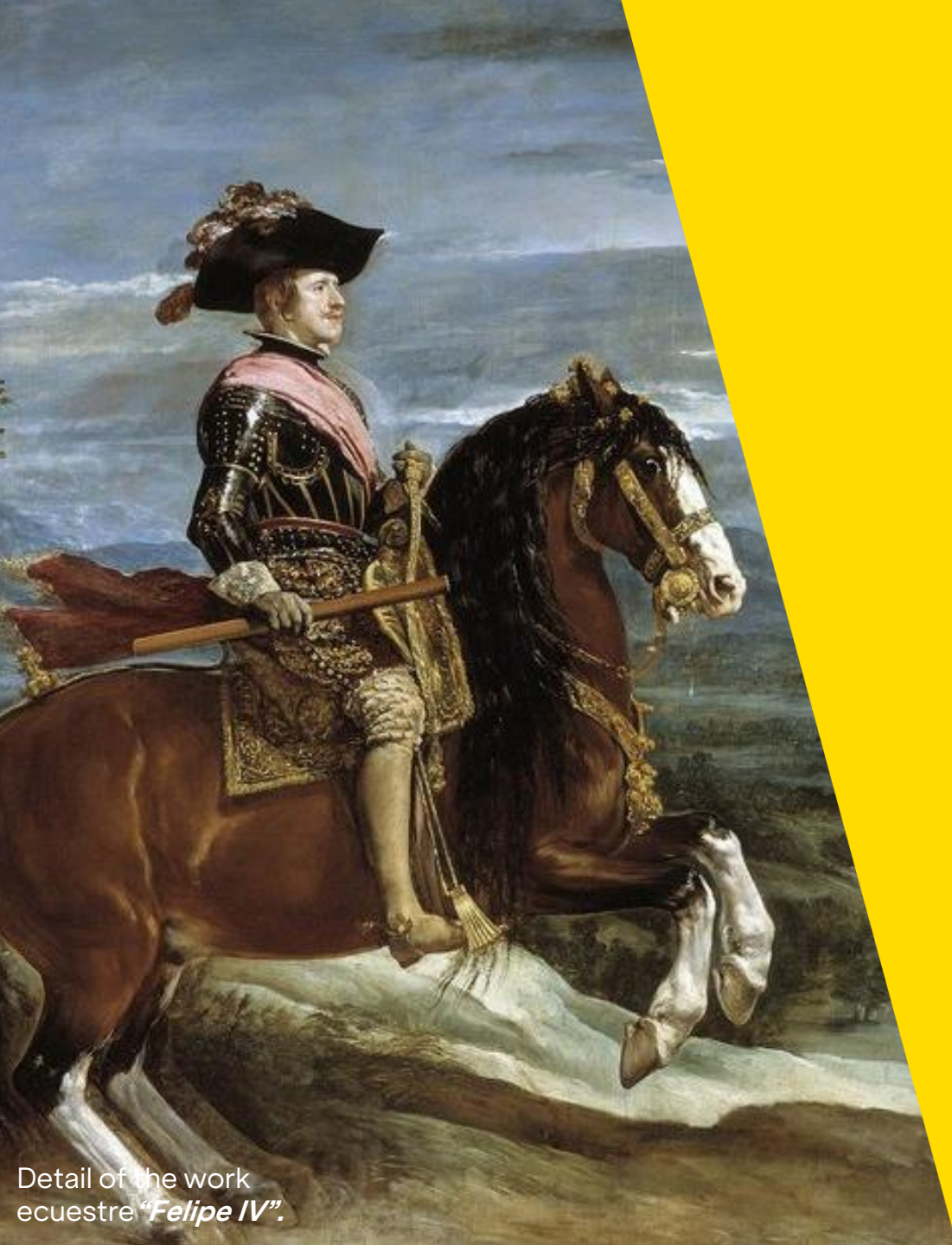
Detail of the work ecuestre " Felipe IV ".

Diego Velázquez, perhaps the best universal genius of painting, was born in the city of Seville on June 6th 1599.