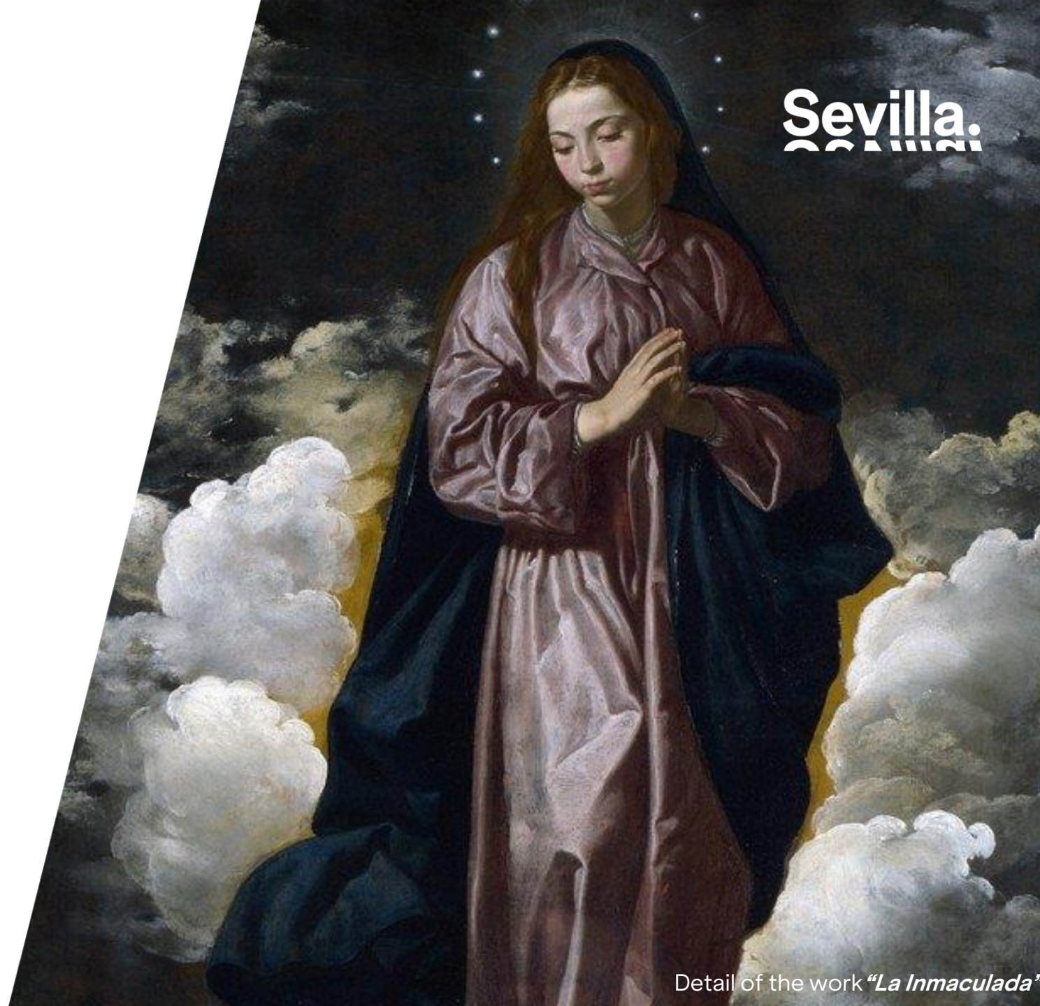
Detail of the work "La Inmaculada"