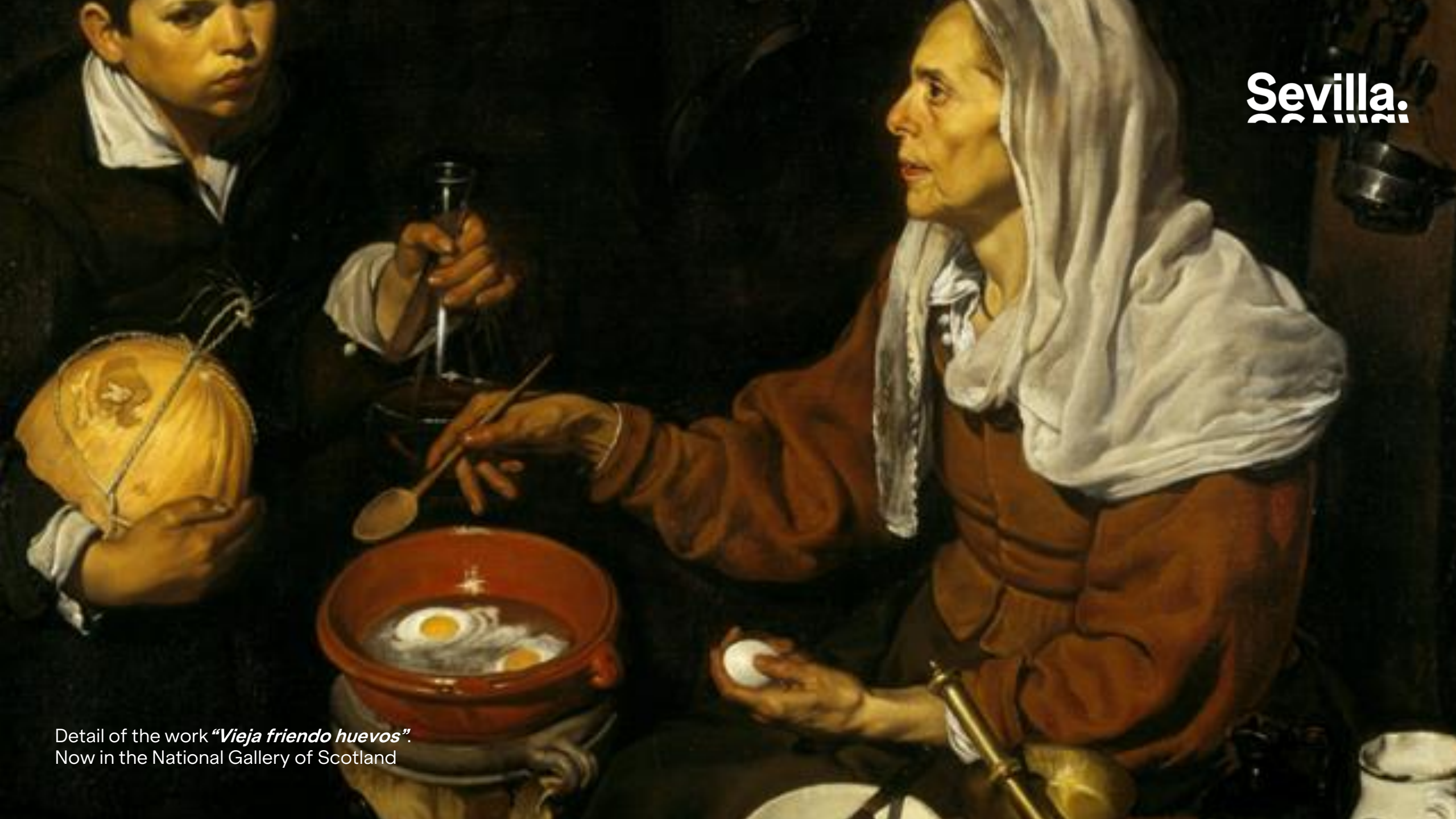
Detail of the work " Vieja friendo huevos ". Now in the National Gallery of Scotland